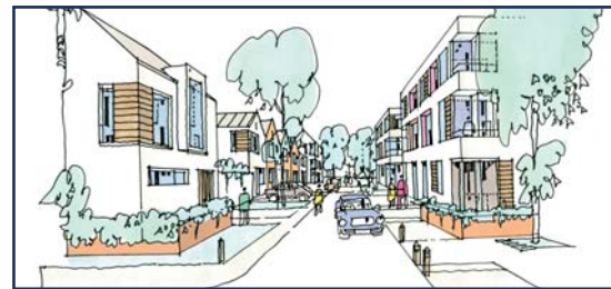
Taylor Woodrow artist's impression

Bidwells, the property consultants on the project, have put in £1,000 towards sending four youngsters on a five-day sailing course on a yacht sailing from the South Coast to Wisbech.