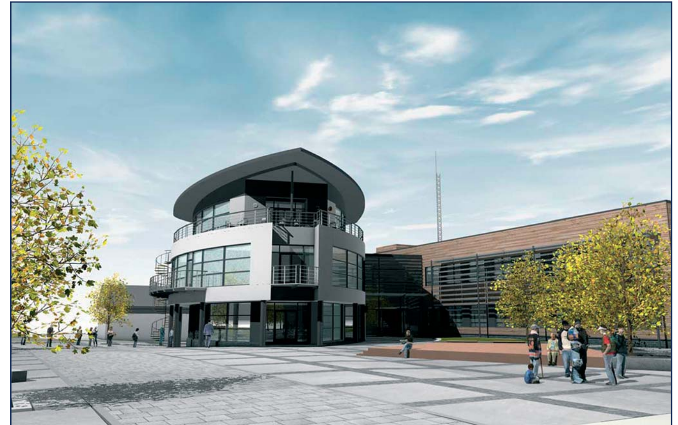
The highly-realistic computer-generated image of the Boathouse has been supplied by the building's architects, Norwich-based Fielden + Mawson.

The Boathouse is the £3.5m flagship that will set the design quality tone and standard for the whole project.